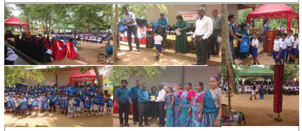
Eriyawa Primary School - Established in 1931, Eriyawa Primary School is located in the remote village of Ehetuwewa in the Kurunegala district under North Western Province. It offers classes from grade 1 -5. Currently 149 students are enrolled in this school. This School has top Grade 5 Results in the area.