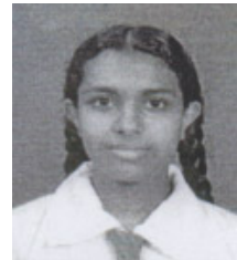
Takshila O/L 2011