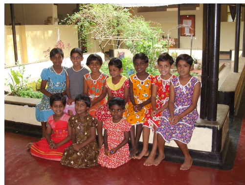
Children from the Viharamahadevi Orphanage.