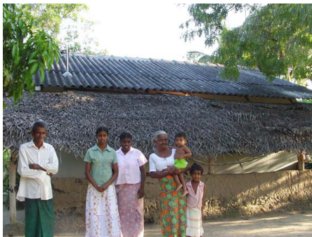
Sponsored child and the family in Welikanda.

We wish to place on record our deep appreciation of the donations we have received for the last 10 years from the Abeynanda and Swarna Perera Trust, made through the Public Trustee of Sri Lanka. The total amount donated amounts Rs. 2,63752.76 approximately £1533.00, all of which has been used to sponsor children. Also we would like to thank all those generous supporters who contributed.