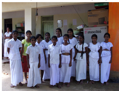
A group of students in Mahiyanganaya.