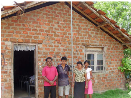
Sponsored child and the family in Padawiya.