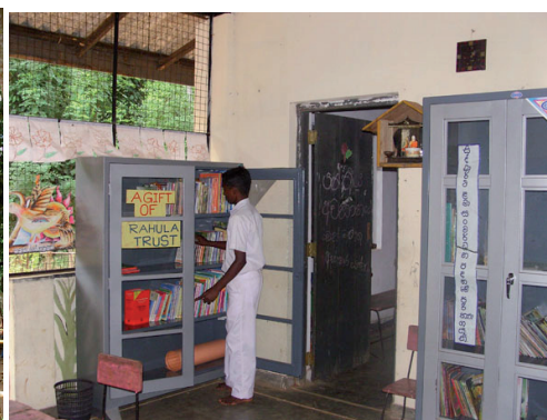
Pre-school in Ranchamadama was supported with books and cupboards.