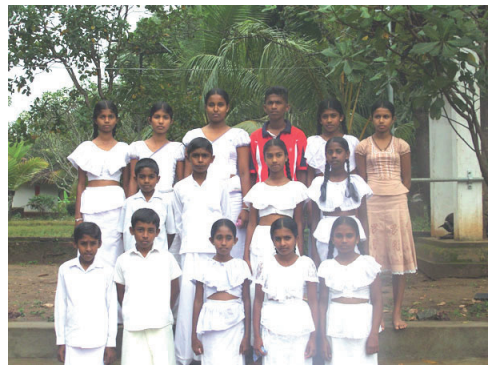
Some of the Sponsored children in Anuradhapura, Badulla, Galle and Kandy districts