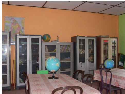
Library books, cupboards and a computer was donated to Tantirimale Tambiyawa Maha Vidyalaya in Anuradhapura

Throughout the last decade the Trust has been expanding slowly. The trustees have been careful not to donate to projects unless they are reasonably confident that the money will be well spent, preferring if possible to donate equipment, rather than money. It can be seen from the published